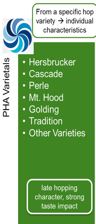
Figure 1: PHA® Varietal

PHA® Varietals are a hop extract in an aqueous propylene glycol carrier, produced by a proprietary physical separation process. It is considered as GRAS (FEMA no. 2580 - Hops, oil). Propylene glycol is registered as a food additive according to Annex II of EU Reg 1333/2008 as well as E1520 and PG is a permitted carrier for flavours as per regulation 2006/52/EC. PHA® products are exclusively supplied worldwide by BarthHaas.